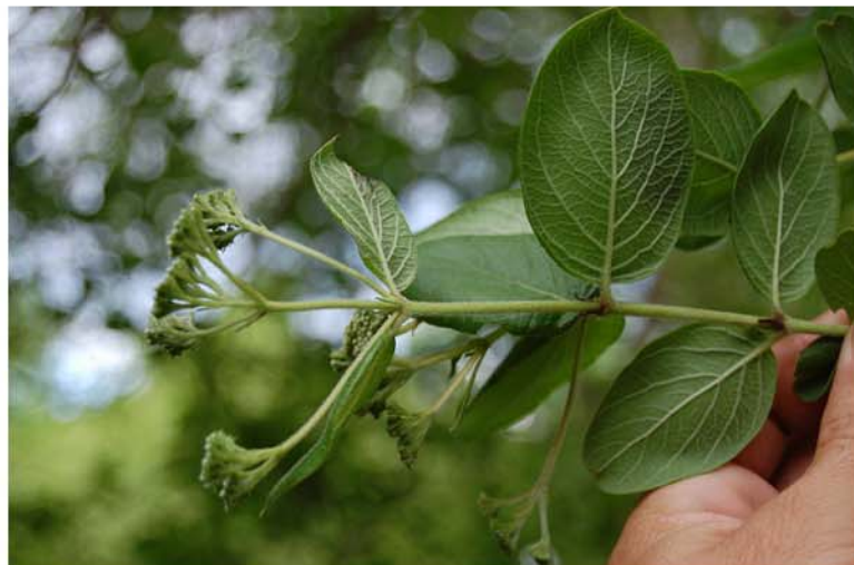
Crossopteryx febrifuga Sofala province, Cherigoma plateau, along marked trail in Catapú; S 18°01', E 35°18'; alt 90 m