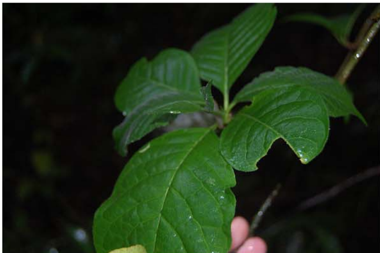
Pavetta comostyla S. Moore subsp. comostyla (?) Mt Tsetsera, in rainforest along road going up the mountain, E 32.83826250, S 19.38556472; UTM36-WGS84 483016.719,7856501.813; alt 1550 m.