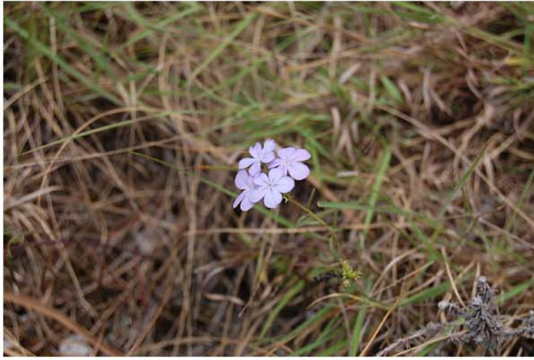
Buchnera chimanimaniensis Philcox Chimanimani mountains, on rocky hill above Pheza forest, E 32.98729070, S 19.73541006, alt 1500 m.