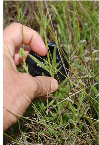
Buchnera longispicata Schinz Mt Tsetsera, grassland, E 32.84062505, S 19.39909362; UTM36-WGS84 483266.182,7855005.032; alt 1950 m.