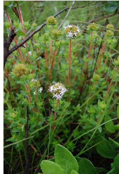
sp02 Mt Tsetsera, grassland, E 32.84062505, S 19.39909362; UTM36-WGS84 483266.182,7855005.032; alt 1950 m.