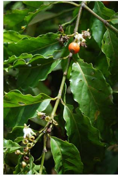
Aidia micrantha (K. Schum.) F. White Moribane forest, along various of Monteiros plot ; E 33.32381850, S 19.72920297 (proxi); UTM36-WGS84, 533930.796,7818452.270 alt 550 m