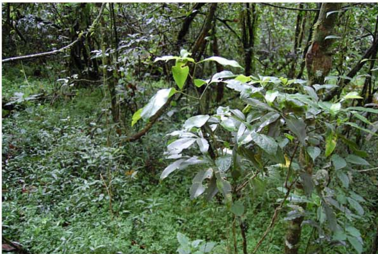
Teclea nobilis Delile Mt Tsetsera, undergrowth of mountain rainforest, E 32.83547724, S19.39908904; UTM36-WGS84 482725.678,7855005.032; alt 1900 m.