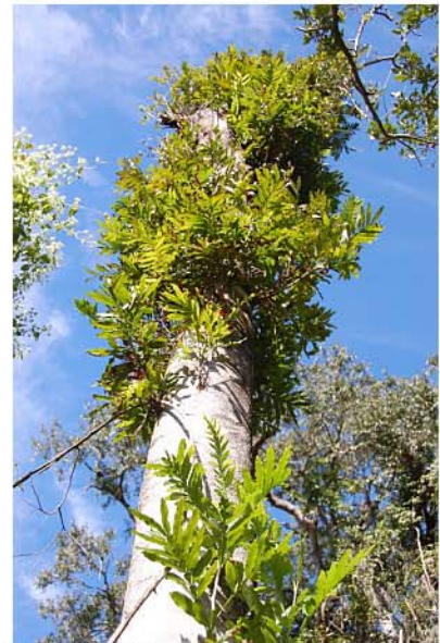
Filicium decipiens (Wight & Arn.) Thwaites Chimanimani mountains, trail going up Mt Nhamedimo from Nhabawa, riverine vegetation along mountain stream, E 33.05399278, S 19.71131645; UTM36-WGS84 505658.152,7820462.998; alt 900 m