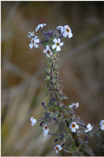
Jamesbrittenia carvalhoi (Engl.) Hilliard Mt Tsetsera, in grassland, E 32.84042651, S 19.39965706; UTM36-WGS84 483245.394,7854942.666; alt 1950 m