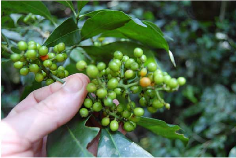
Teclea nobilis Delile Chimanimani mountains, Pheza forest above Chikukwa camp, E 32.98655417,-19.73282883, alt 1400 m.