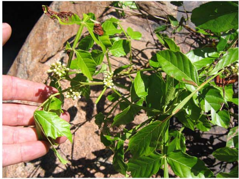
Paullinia pinnata L In riverbed of river Mucudzo (also seen in riverbed of Pungue); E 34.20, S 18.63, alt 300 m