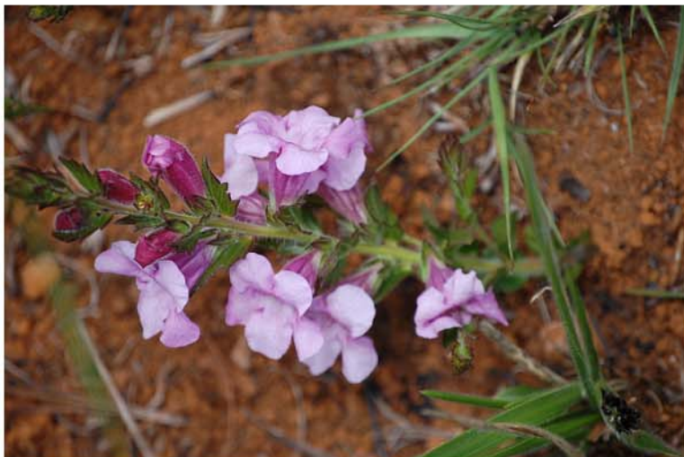
Graderia scabra (L.f.) Benth. Mt Tsetsera, grasslands towards the top of the plateau, E 32.79926601, S 19.38158055; UTM36-WGS84 478921.359,7856938.374; alt 2200 m