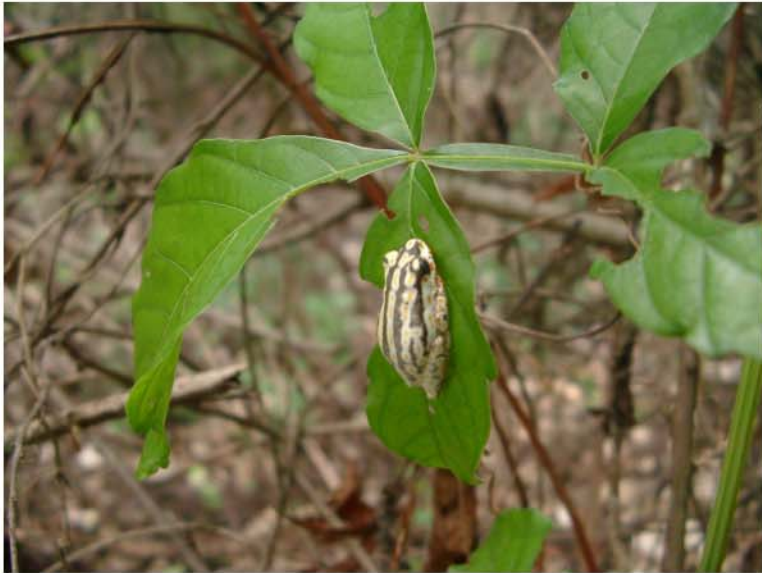
Paullinia pinnata L Zomba, buffer zone of Chimanimani reserve, margin of dense woodland,