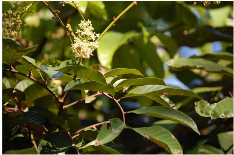
Aporrhiza paniculata Radlk. Moribane forest, Mpunga camp, E 33.35557254, S 19.74402434; UTM36-WGS84 537254.686,7816805.502; alt 500 m