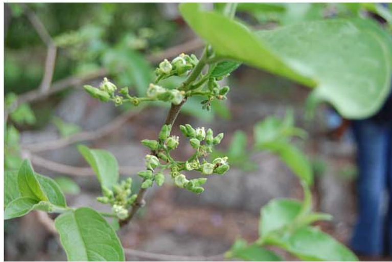
Rothea myricoides (Hochst.) Steane & Mabb. in remains of mountain rainforest on Mt Garuso, E 33.16, S 18.95, alt 1000 m