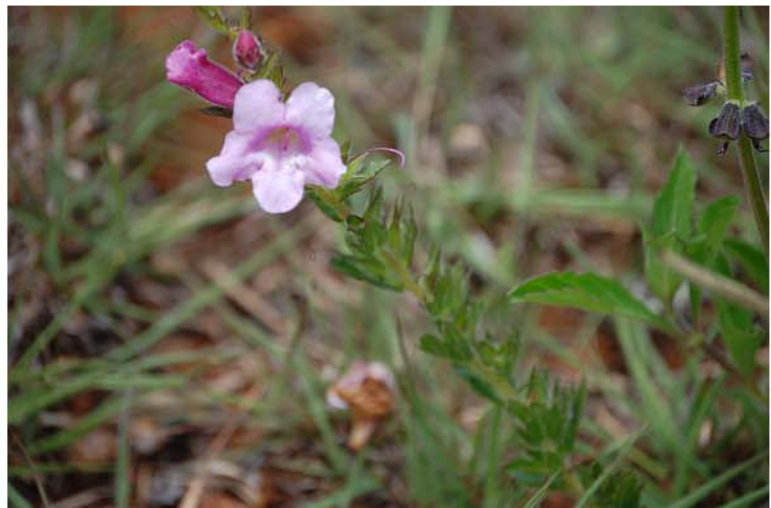
Graderia scabra (L.f.) Benth. Mt Tsetsera, grasslands towards the top of the plateau, E 32.79926601, S 19.38158055; UTM36-WGS84 478921.359,7856938.374; alt 2200 m