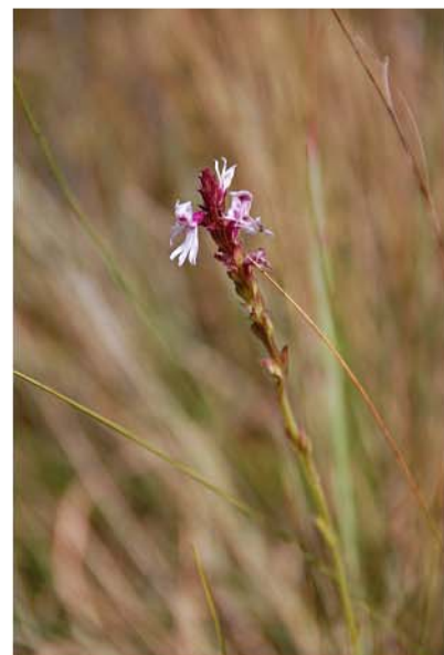
Striga bilabiata (Thunb.) Kuntze (?) Chimanimani mountain range, Muvumodzi headwaters, in quartzite grassland, E 33.09636353, S 19.76419989, alt 1700 m