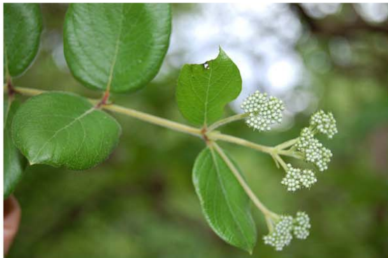
Crossopteryx febrifuga Sofala province, Cherigoma plateau, along marked trail in Catapú; S 18°01', E 35°18'; alt 90 m