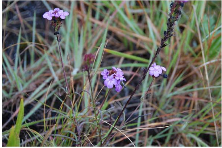
Buchnera chimanimaniensis Philcox Chimanimani mountain range, wet grassland, on quartzite sandy soils, between the headwaters of the Muvumodzi and "Bakoramambo"; E 33.10, S 19.80, alt 1600 m