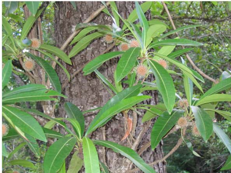
Breonadia salicina (Vahl) Hepper & J.R.I. Wood Chimanimani conservation area, riverine vegetation in woodland along Mussapa pequeno at the "portão"; E 33.08467816, S 19.58420245; UTM36-WGS84 508880.806,7834527.580; alt 600 m.