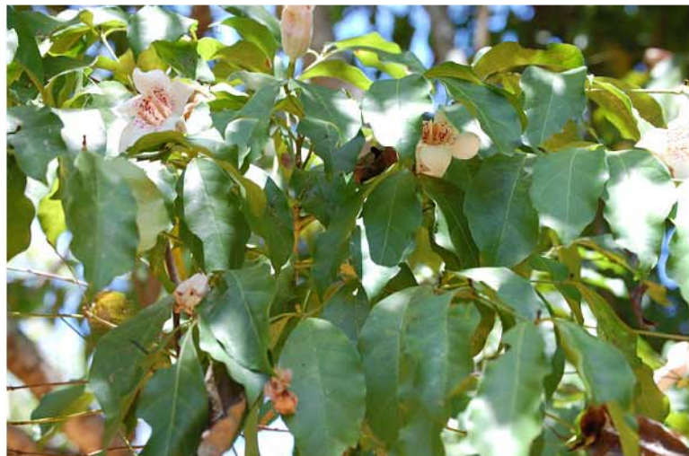
Rothmannia manganjae (Hiern) Key Moribane forest, Mpunga camp, E 33.35557254, S 19.74402434; UTM36-WGS84 537254.686,7816805.502; alt 500 m