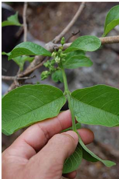
Rothea myricoides (Hochst.) Steane & Mabb. in remains of mountain rainforest on Mt Garuso, E 33.16, S 18.95, alt 1000 m