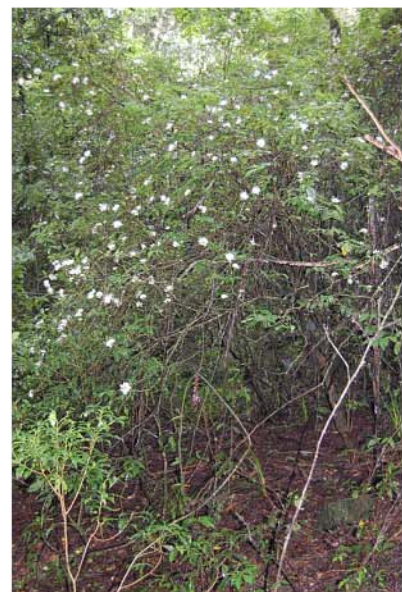
Pavetta comostyla S. Moore subsp. comostyla (?) Mt Tsetsera, in rainforest along road going up the mountain, E 32.83826250, S 19.38556472; UTM36-WGS84 483016.719,7856501.813; alt 1550 m.