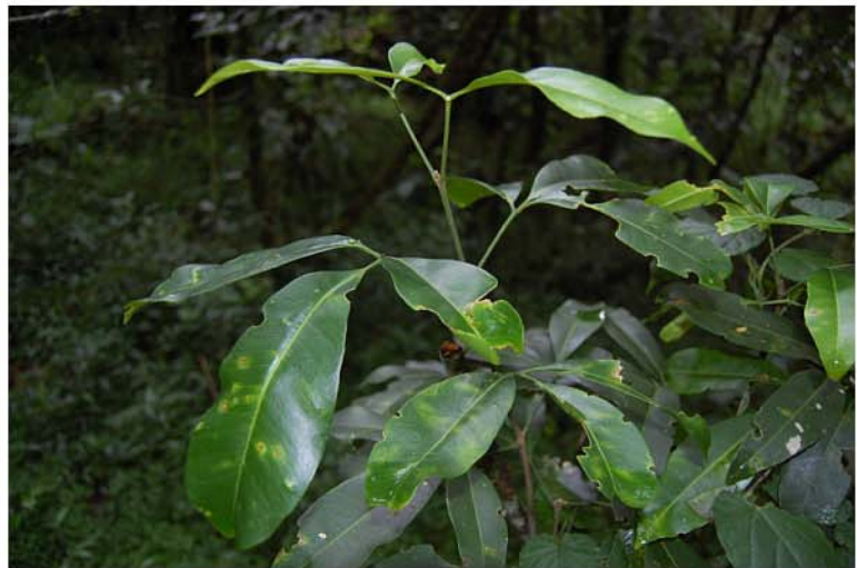
Teclea nobilis Delile Mt Tsetsera, undergrowth of mountain rainforest, E 32.83547724, S19.39908904; UTM36-WGS84 482725.678,7855005.032; alt 1900 m.