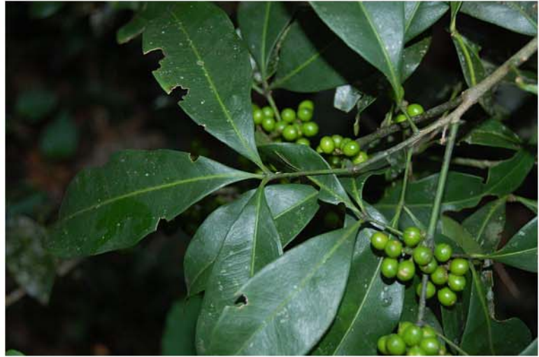
Teclea nobilis Delile Chimanimani mountains, Pheza forest above Chikukwa camp, E 32.98655417,-19.73282883, alt 1400 m.