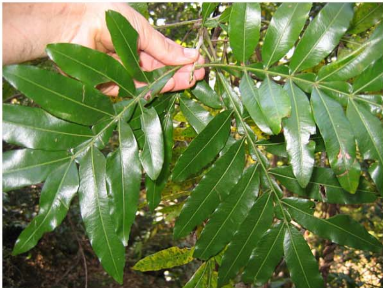
Filicium decipiens (Wight & Arn.) Thwaites Chimanimani mountains, after first steep climb, in riverine forest; E 33.05, S 19.75, alt 1100 m