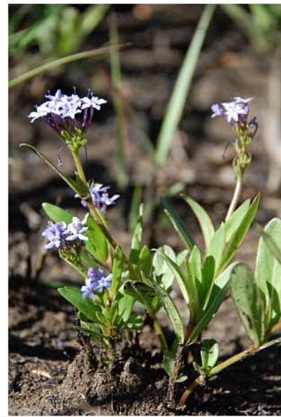
Pentanisia schweinfurthii (Hiern) Chimanimani mountains, along Nhamadzi river, around second time crossing the river, in recently burned grassland, E 33.06, S 19.75m qjt; 1300 m