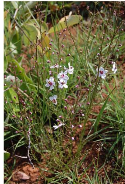
Sopubia mannii Skan. Chimanimani mountains, in grassland above Chikukwa camp, along path going to Pheza forest; E 32.97668372, S19.72020099, alt 1100 m.