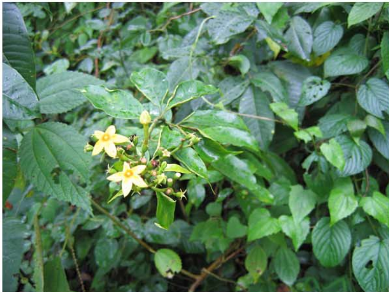
Mussaenda arcuata Lam. ex Poir Mt Tsetsera in first small patch of mountain rainforest going up; E 32.84539515, S 19.37974687; UTM36-WGS84 483765.109,7857146.261; 1500 m