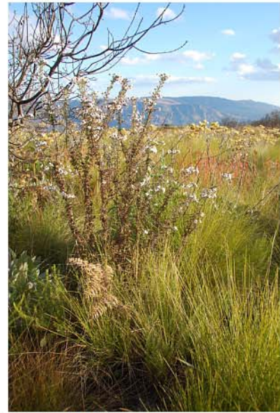
Jamesbrittenia carvalhoi (Engl.) Hilliard Mt Tsetsera, in grassland, E 32.84042651, S 19.39965706; UTM36-WGS84 483245.394,7854942.666; alt 1950 m