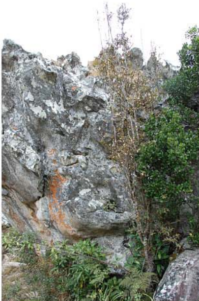
Sericanthe sp. B (Chimanimani taxon) Chimanimani mountains (Zimbabwe), trail going up "second ridge" towards mountain hut (mostly rather shallow/rocky soils derived from quartzite); E 33.00029445, S 19.79120440; UTM36-WGS84 500030.841,7811623.744; alt 1600 m