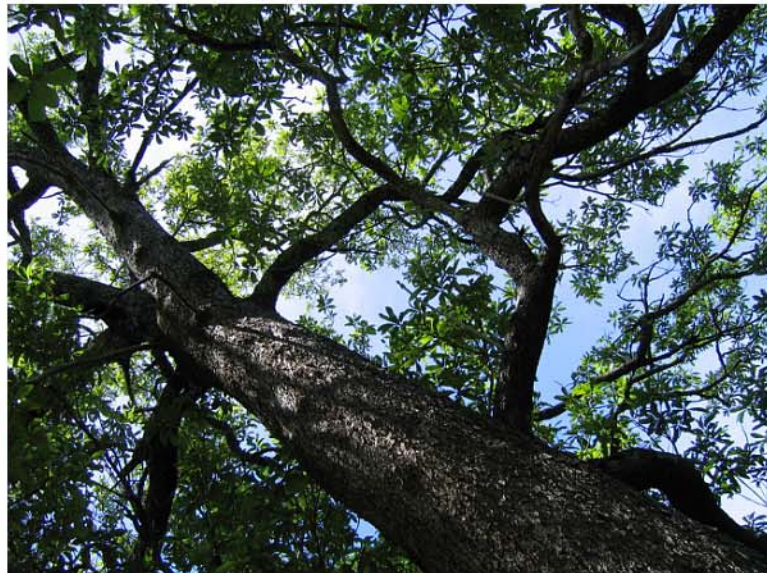
Breonadia salicina (Vahl) Hepper & J.R.I. Wood Chimanimani conservation area, riverine vegetation in woodland along Mussapa pequeno at the "portão"; E 33.08467816, S 19.58420245; UTM36-WGS84 508880.806,7834527.580; alt 600 m.