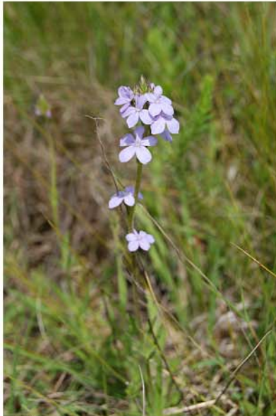
Buchnera longispicata Schinz Mt Tsetsera, grassland, E 32.84062505, S 19.39909362; UTM36-WGS84 483266.182,7855005.032; alt 1950 m.