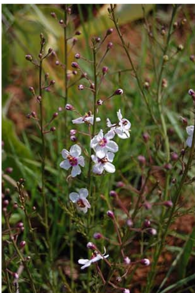
Sopubia mannii Skan. Chimanimani mountains, in grassland above Chikukwa camp, along path going to Pheza forest; E 32.97668372, S19.72020099, alt 1100 m.