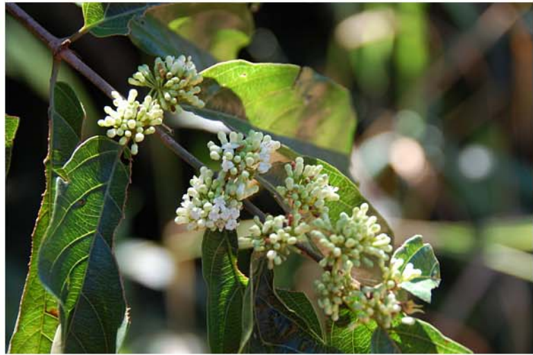
Keetia gueinzii (Sond.) Bridson Moribane forest; along the main road; E 33.33607445, S 19.72676161; UTM36-WGS84 535215.562,7818719.930; alt 600 m