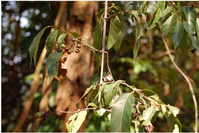
Keetia gueinzii (Sond.) Bridson Moribane forest, Mpunga camp, E 33.35557254, S 19.74402434; UTM36-WGS84 537254.686,7816805.502; alt 500 m