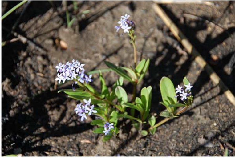
Pentanisia schweinfurthii (Hiern) Chimanimani mountains, along Nhamadzi river, around second time crossing the river, in recently burned grassland, E 33.06, S 19.75m qjt; 1300 m