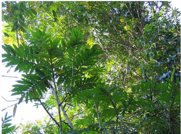
Filicium decipiens (Wight & Arn.) Thwaites Chimanimani mountains, after first steep climb, in riverine forest; E 33.05, S 19.75, alt 1100 m