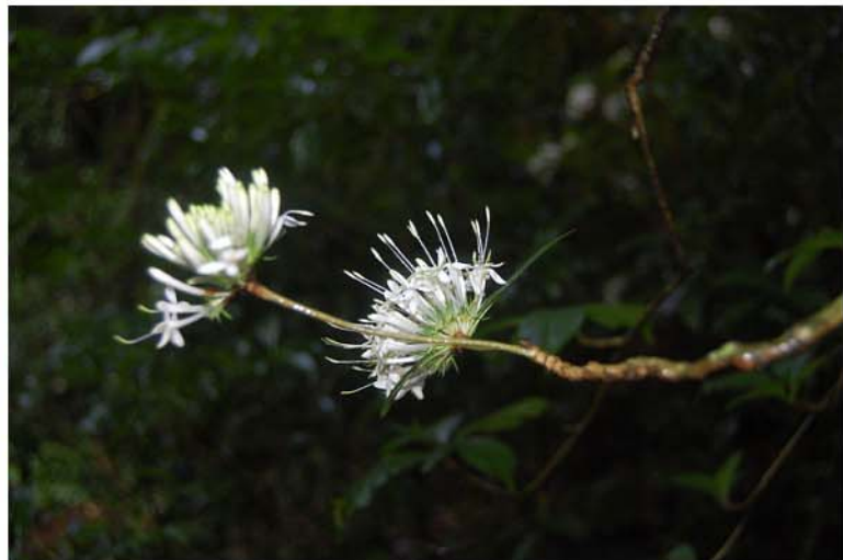
Pavetta comostyla S. Moore subsp. comostyla (?) Mt Tsetsera, in rainforest along road going up the mountain, E 32.83826250, S 19.38556472; UTM36-WGS84 483016.719,7856501.813; alt 1550 m.