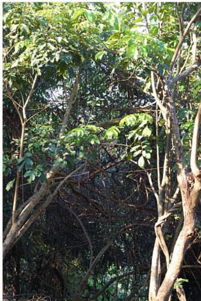
Aporrhiza paniculata Radlk. Moribane forest, Mpunga camp, E 33.35557254, S 19.74402434; UTM36-WGS84 537254.686,7816805.502; alt 500 m