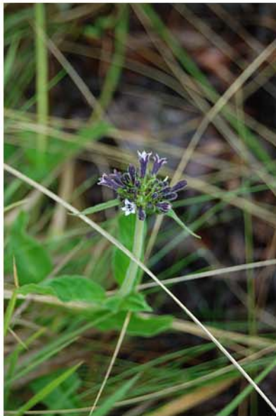
Pentas purpurea Oliv. Mt Tsetsera, grassland, E 32.84062505, S 19.39909362; UTM36-WGS84 483266.182,7855005.032; alt 1950 m.